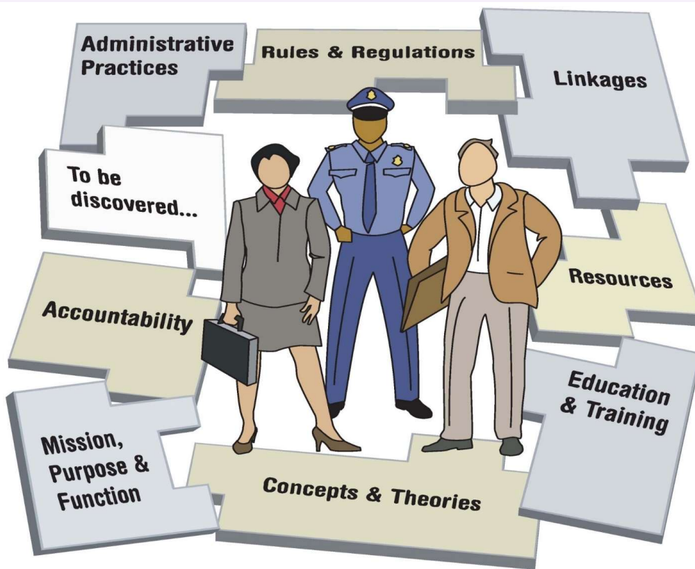
Figure 8: Audit Trails